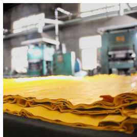
MOLDED-IN YELLOW RUBBER