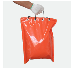
CAPACITY OF 15 KG (33 LBS)