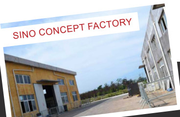
SINO CONCEPT FACTORY