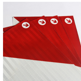
HIGHLY REFLECTIVE SHEETINGS