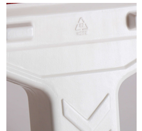
COMPANY NAME OR LOGO