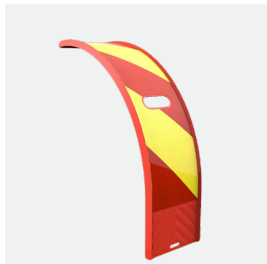
MADE OF POLYURETHANE