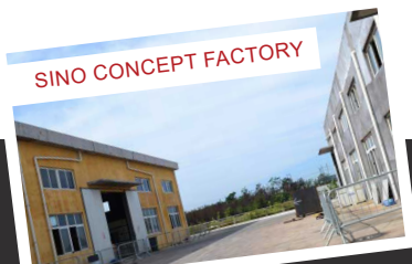
SINO CONCEPT FACTORY