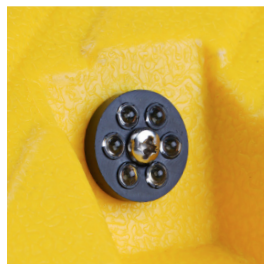
GLASS BEAD REFLECTORS