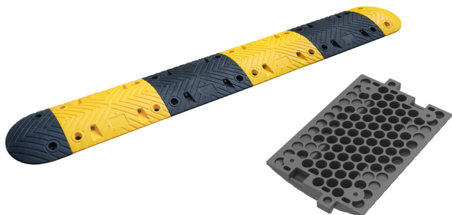
5 CM STANDARD VERSION