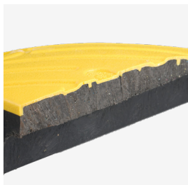
YELLOW MOULDED-IN COVER