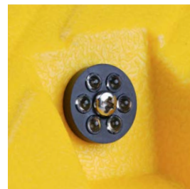
GLASS BEAD REFLECTORS