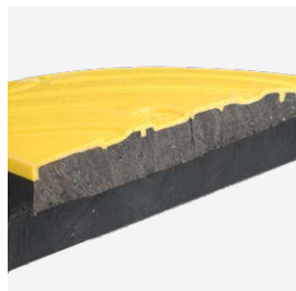
YELLOW MOULDED-IN COVER