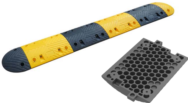
7 CM STANDARD VERSION